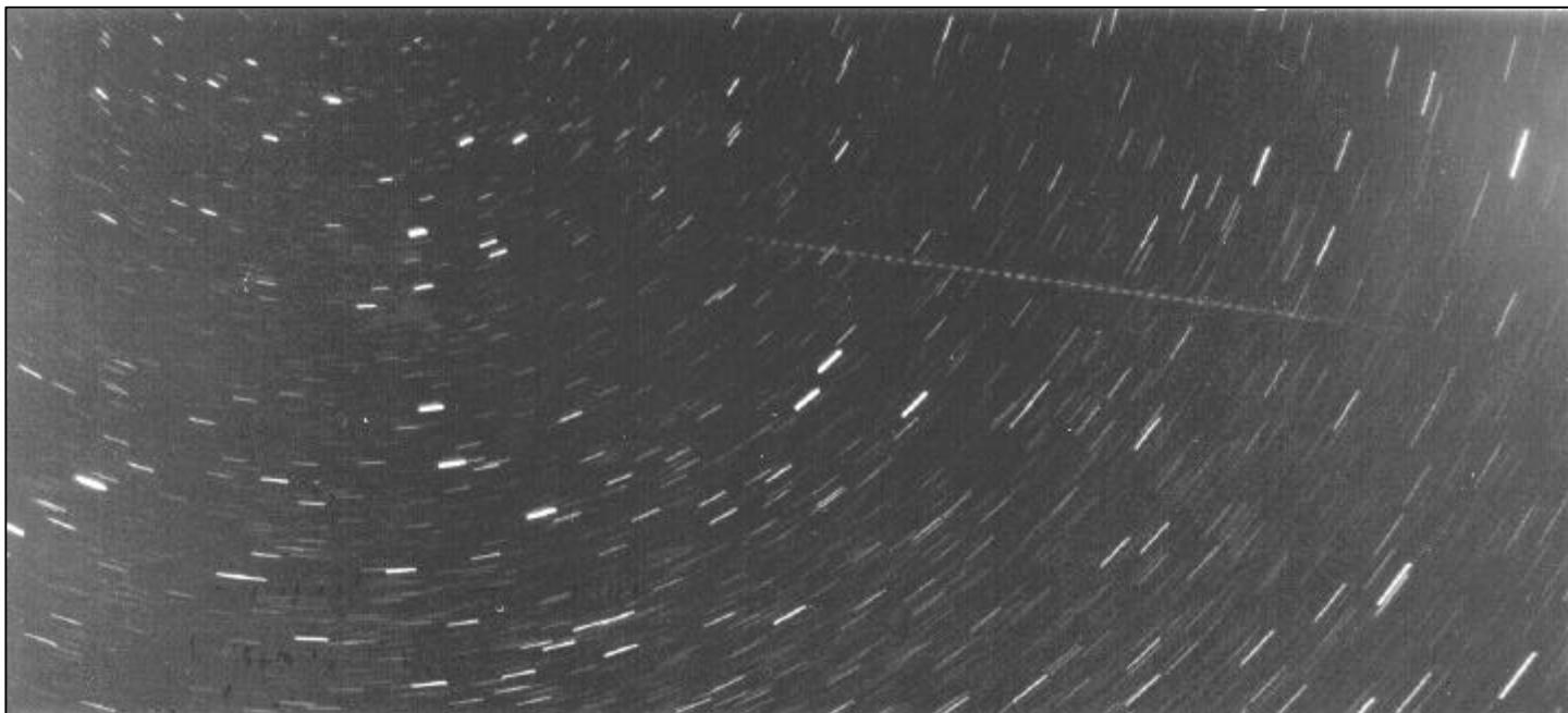
Figure 2 : One of three. Multistation image of a -1 meteor on July 17, 1996 2h49m06s UT. Pantano Grande, Brasil.

Alegre, where we stationed all three camera setups on a grass field under a nice clear sky. All three teams made serious attempts to run the systems and record the time of bright meteors. After solving many small and big problems, everybody was left with a strong sense of confidence. Whatever would happen the next night, the observers would be ready for it.