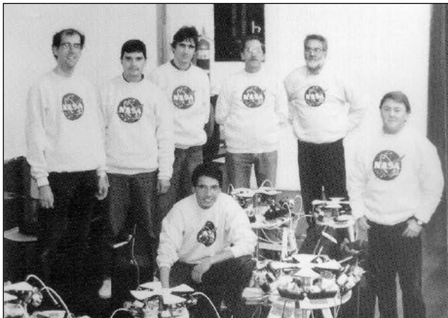
Kappa Pavonid campaign. Porto Alegre, July 15-17, 1996

1996 would offer another chance. It was a long shot, since no outburst of the shower had ever been reported before when planetary positions were the same and it is not certain that the 1986 meteor outburst was of far-comet type. However, this event was our last chance for as much as five years to see another outburst of a stream suspected